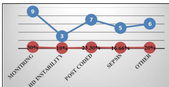
Figure 3: Percentage and Cause of Transferring to ICU