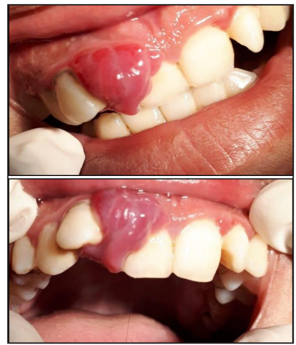
Figure 1: Clinical Picture Showing Pedunculated Mass in Maxillary Right Anterior Region

incisor. On palpation it was a non-tender and pedunculated mass as shown in Figure 1. It was attached to the interdental papilla on both buccal and palatal sides. A diagnosis of pyogenic granuloma (pregnancy tumor) was made and simple surgical excision with curettage was planned.